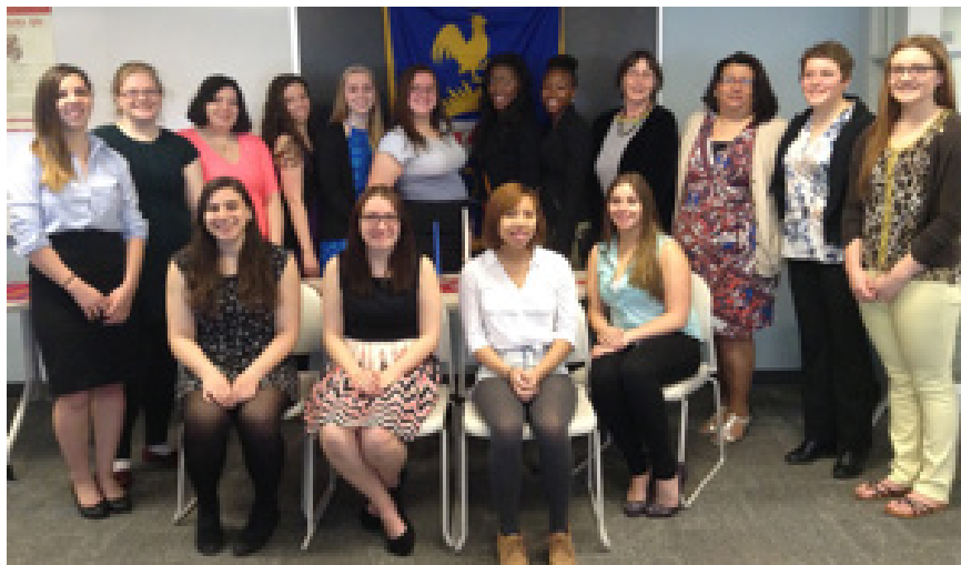
Theta Delta Spring 2015