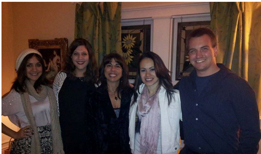
Epsilon Tau chapter at Texas State University