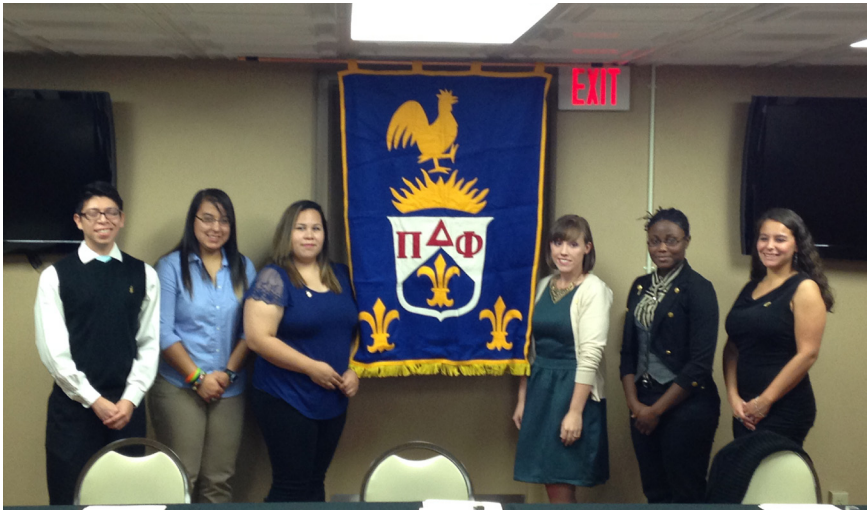
ETA IOTA Spring 2015