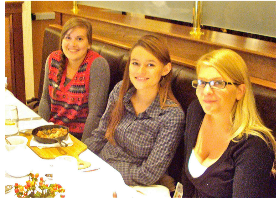
Some of the ZETA RHO members seated on a banquette with an hors d'oeuvre.