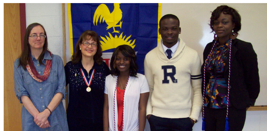
Initiation ceremonies at Morgan State University's THETA PSI Chapter (29 March 2012)

During the 2011 academic year, the THETA PSI Chapter, in cooperation with Morgan State University's Cercle Français, presented various programs, which were open not only to students of French, but to all interested persons. These presentations included talks by Francophone natives, French games and puzzles, a holiday celebration of “Noël en France,” and Francophone music programs. THETA PSI also participated in “La Semaine du français” and in the university's annual programs during International Education Week.