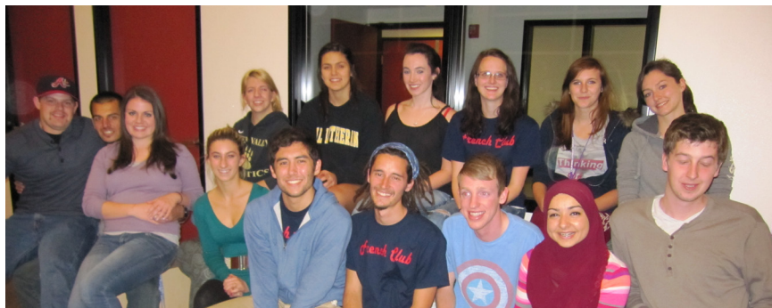
French Club and Pi Delta Phi members from ZETA CHI smile for a group photo at the fondue party in Grace Hall at California Lutheran University on February 8 th , 2012.