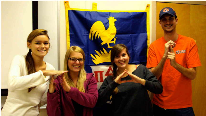
Four new ZETA RHO members making the Greek letters Pi Delta Phi with their hands.

The ZETA RHO chapter also uses part of its budget to contribute a gift to the annual French Award for honors day at Georgia Southern. The new activism of the chapter enhances the French major at Georgia Southern.