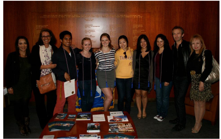
BETA chapter of University of Southern California held their induction ceremony on March 27 th , 2012.