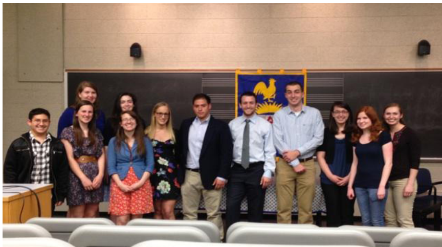
The students of Eta Omicron smile for a photo