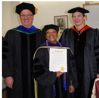
Chapter Mu Gamma at the University of Wisconsin-Milwaukee inducts Honorary Member Christiane Taubira, Minister of Justice in France, in 2016.

Members are also encouraged to join our free Facebook®, LinkedIn®, Instagram® and Bluesky® social media groups.