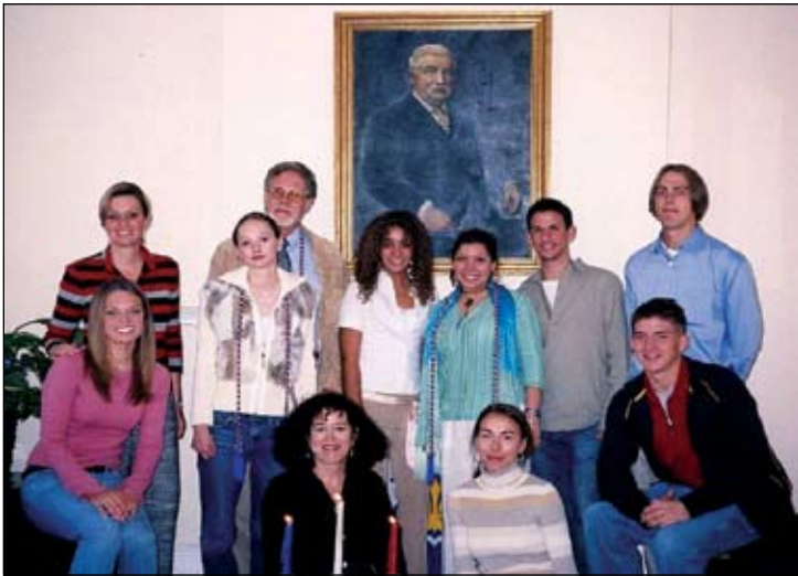
Zeta Pi Chapter Initiation

ZETA PI of Lindenwood University in St. Charles, MO inducted 8 new Regular Members and one Honorary Member last November. Some highlights among the Society's activities during the 2005-2006 school year include an outing to see the Compagnie Claude Beauclaire's performance of Sartre's Huis Clos at the Loretto-Hilton Theatre in October, singing French songs as part of the entertainment program at the University's International Festival, and a French food potluck dinner in March. Some Pi Delta Phi members are also learning to give gallery tours, in French, of the current exhibit at the Pulitzer Foundation in St. Louis. In April 2006 they will give the tour first to area high school students of French and then to other students from Lindenwood University and the University of Missouri St. Louis. Other members are spending their Spring semester studying at the Université de Caen, a new requirement of the French major at Lindenwood.