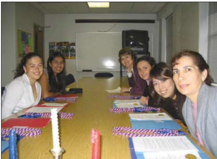
ETA IOTA Initiation at Sam Houston State University, March 2006.