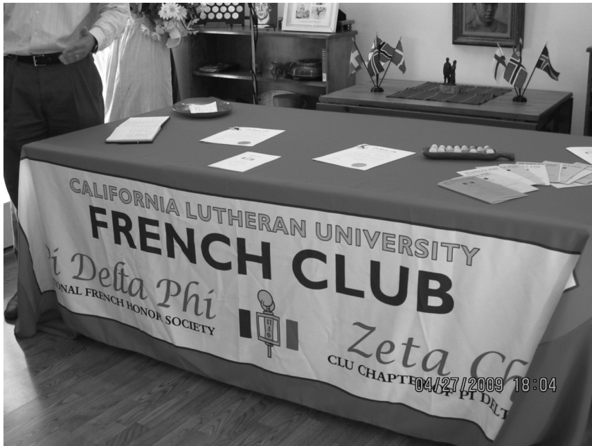
Zeta Chi's new table wrap making its debut at the Spring 2009 initiation on Monday, April 27.