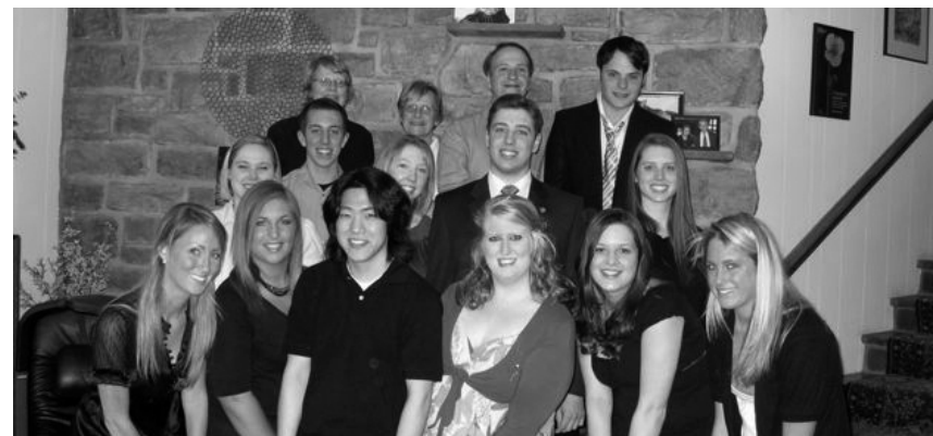
Iota Mu chapter members gather for a photo at the Spring 2009 initiation ceremony on April 5, 2009.