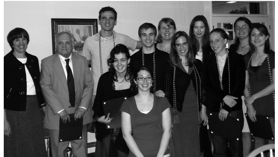
Mu Iota chapter initiation at SUNY at Geneseo