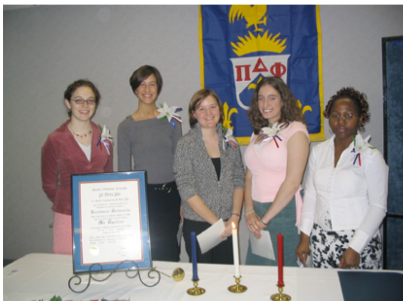
Newly inducted members of Mu Upsilon at Rockhurst University in Kansas City, MO