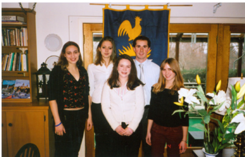
Initiates of IOTA MU at Albright College in Reading, PA