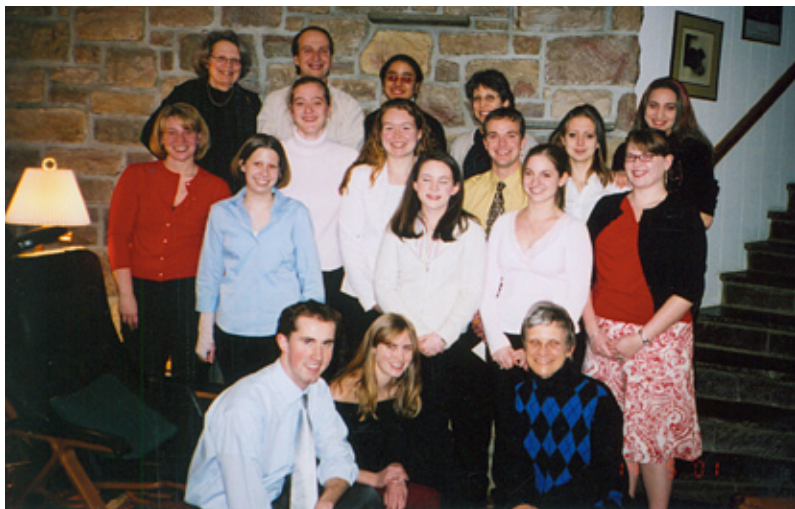
Initiates and guests at the IOTA MU April 3 initiation