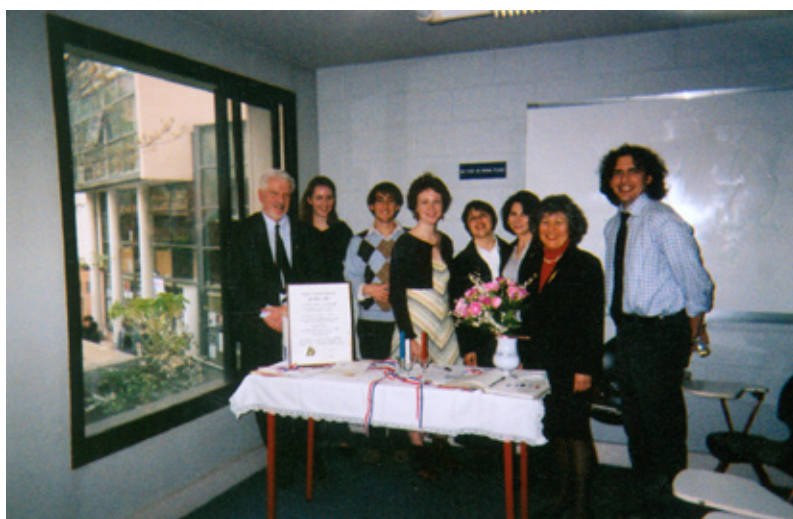
The April 22 initiation of KAPPA BETA chapter at the University of Paris